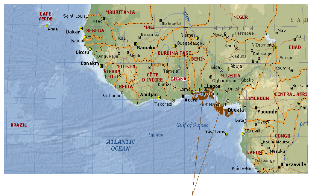
Sample Collection Region