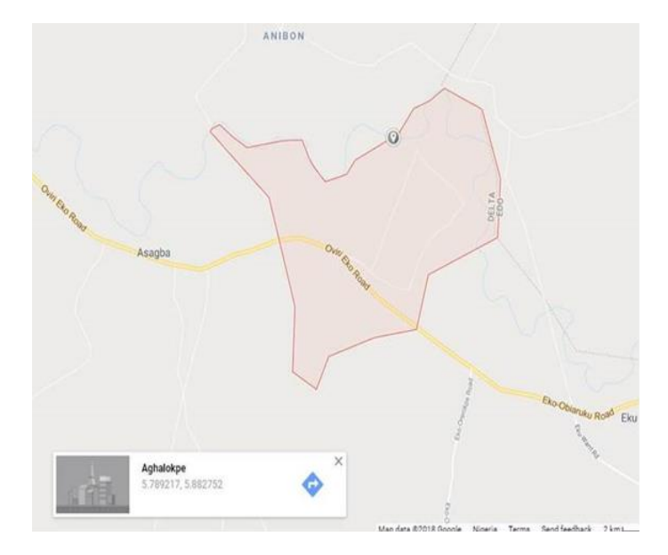
Figure 1: Showing Wetland in Aghalokpe, Study Area in Delta State, Nigeria