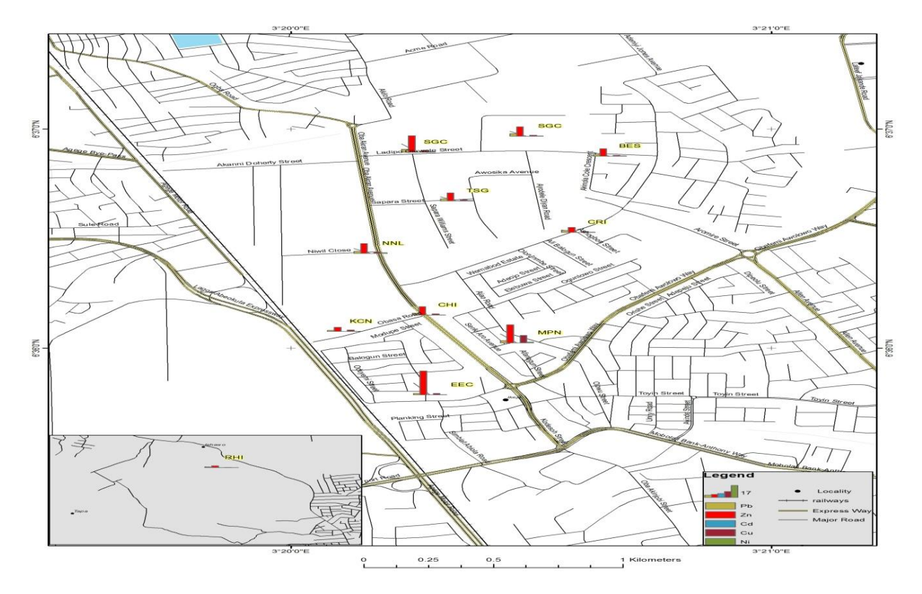
Figure 2: GIS Map of Ikeja Industrial Area Showing the Mean Concentrations of each sampling site. KEY : KCN = Kara.com.ng ; MPL = Manufacturing Production Limited ; NNL = Niwil Nigeria Limited ; TSG = Tom & Service group of company; SGC = Sanga Group of Company; SGC 1 = Sky Group of Company; BNL = BESNAL Nigeria Limited; CRI = Chinese Restaurant Ikeja; CHI = ; Chemline House Ikeja; EEC = ECWA Evangelical Church; RHI = Residential House Ikorodu (control).

This study was conducted in Ikeja Industrial area (N6<sup>o</sup>66.250 3<sup>o</sup> 47.524'E - N6<sup>o</sup> 59.988'3<sup>o</sup>33.451'E) areas of Lagos state, namely Kara.com.ng, Manufacturing Production Limited, Tom& Service group of company, Niwil Nigeria Limited, Sanga Group of Company, Sky Group of Company, BESNAL Nigeria Limited, Chinese Restaurant Ikeja, Chemline House Ikeja, ECWA Evangelical Church, Residential House Ikorodu (Control).The sampling points were at least 300 m from main roads and 100 m from minor roads. Figure 1 is the GIS map showing the sampling locations.