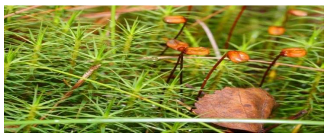
Figure 1: The Moss plant (Polytrichum commune)

determine concentrations in the annual growth segments (Ceburnis et al., 2002;Cenci et al, 2003; Poikalainen, 2004; Wang et al., 2008). There are several species of mosses available in Nigeria and earlier surveys have shown these local species to be suitable for biomonitoring atmospheric heavy metal pollution (Ojiodu et al., 2017; Ojiodu et al., 2018a,b; Ekpo et al., 2012; Fatoba and Oduekun, 2004; Adebiyi and Oyedeji, 2012; Aniefiok et al., 2014; Sa'idu, 2015). The dense carpets that Polytrichum commune and other pleurocarpous mosses form on the ground have turned out to be very effective traps of heavy metals in precipitation and airborne particles. The objectives of this research are to assess and evaluate the levels of some heavy metals Zn, Pb, Cu, Ni and Cd content in the atmosphere of Ikeja Industrial area, determine the baseline levels and bioaccumulation of heavy metals and determine whether there is a significant difference in the levels of heavy metals from one location to another within the study area.