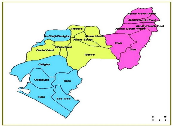
Figure 1: Map of Ondo State Showing Ilaje Local Government